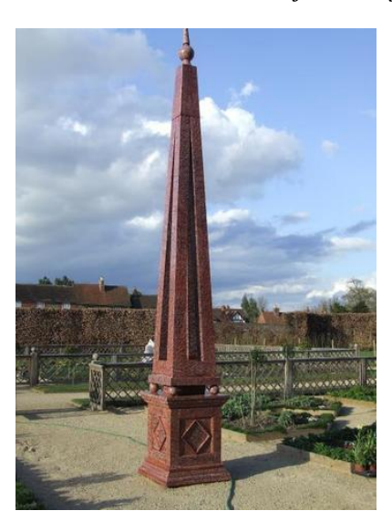
One of the obelisks that still stands in the garden of Kenilworth Castle