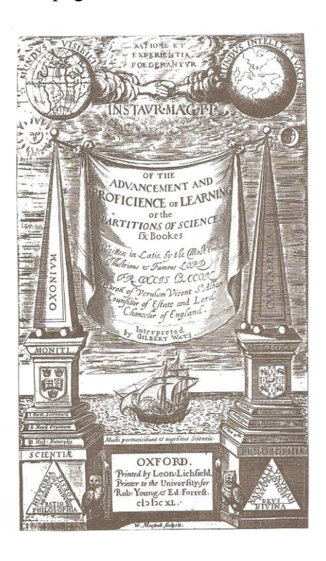
Title Page of The Advancement and Proficience of Learning

garden. He describes them as "obelisks, and spheres... upon a base of two feet square, and high...a square pilaster rising pyramidically fifteen feet high... whereupon for a capital, an orb of ten inches thick." Many years later, the same obelisks appear as the Masonic twin pillars on the title page of Bacon's Advancement of Learning :